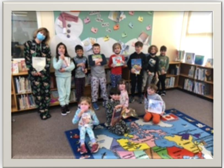
Llama, Llama in Pajamas

Last week was Unplug and Play Family Literacy Week. We hope you all had some opportunities to play and read together. Remember to bring in your completed school Challenge pledge sheets.