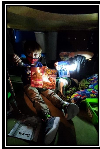
Friday Flashlight Reading